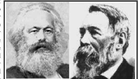
Karl Marx & Frederick Engels - the founders of scientific socialism.

Karl Marx and with him Frederick Engels stood matters on their head. They developed the ideas of scientific socialism (vs. utopian socialism) based on the real, existing social conditions. Their ideas were based partly upon those of the utopian socialists and partly from observing and participating in the rising class struggle. They explained that the rise of capitalist production brought with it a huge step forward for humanity. It socialized production. In other words, goods were now produced not just by and for one or two individuals. It was no longer the case of a peasant ("serf") working in the field for himself, his family and some for his lord. Now, a huge mass of workers gathered together to collectively produce goods that would then be distributed in society as a whole, rather than for personal consumption. This was a huge step forward, as