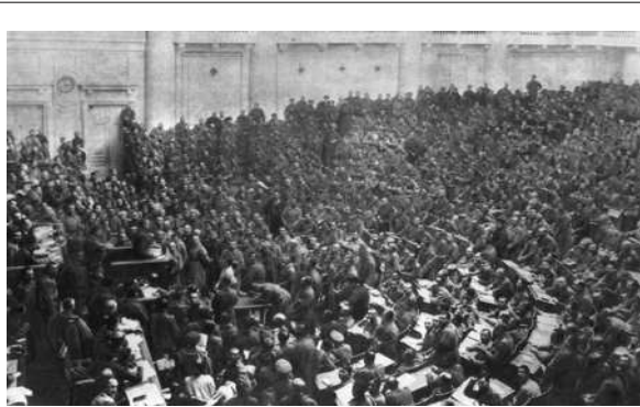
Workers' Council meeting after Russian Revolution - This council was the new form of government

This tendency is not limited to this one example. The world over, workers have moved to form such workers' councils whenever the class struggle reached a fever pitch. The foremost example was that of the Russian workers during the