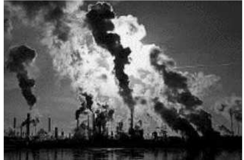
Capitalism is destroying the health of human beings and of the planet as a whole. Reversing these disastrous effects would be one of the major tasks under socialism.

a problem. Although every reputable scientific group today concedes the fact of global warming, the Bush administration claims that it is not yet proven and that more study is necessary. It is nearly certain that this global warming will result in the flooding of entire islands, elimination of vast areas where basic crops are