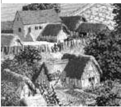
An Early Feudal “Manor”, or Small Town

For instance, under feudalism, the peasant (“serf”) was tied to the land; he or she was forbidden to leave the land they worked. This was possible (and necessary) because they were not in the main producing goods to be sold on an ever changing