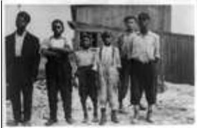
Capitalism has developed based on exploitation of child labor, racism, sexism and poverty.

forces workers to compete for education, jobs and housing. They are encouraged to see other racial, national and ethnic groups – as well as the opposite sex – as their competitors, rather than as their brothers and sisters in the struggle. The entertainment industry plays into this by encouraging negative stereotypes of black people, Latinos, etc. At the same time, it regularly associates sex with human exploitation and violence, encouraging this association in young people's minds. It also encourages a general fear of others (as brilliantly shown in the documentary by Michael Moore, "Bowling for Columbine"). All of this leads to a general level of racism and sexism in society similar to running a constant